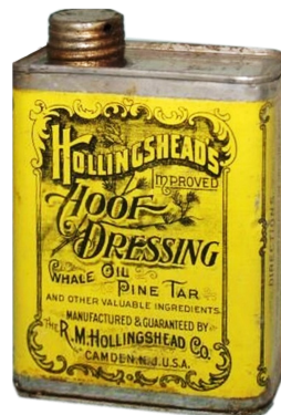
Hollingshead Hoof Dressing