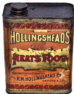
Hollingshead Neats Foot