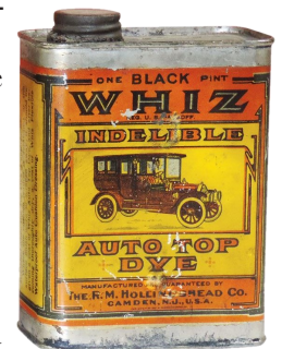
Hollingshead Auto Top Dye