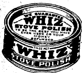
1914 stove polish ad

Open this as a PDF file on rivertonhistory.com and all of the blue highlighted underlined terms become links to more content.