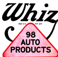
Motor West magazine, Dec. 1, 1920, p5.

By 1920 the thriving peacetime Hollingshead enterprise boasted of producing 98 automotive products, in addition to household products such as polishes, soaps and cleaning agents, floor wax, and insecticides.