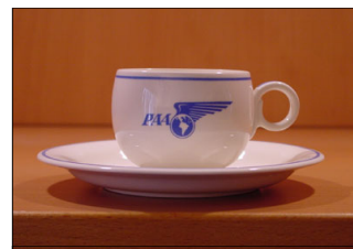
One of Cusack's rare items is this 1930s demitasse cup, used on the Flying Boats. He paid $600 for it.